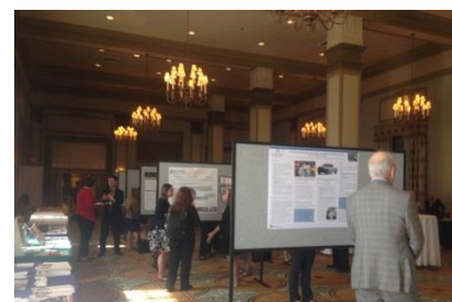
Poster presentations spanned two days and included diverse topics in medical librarianship